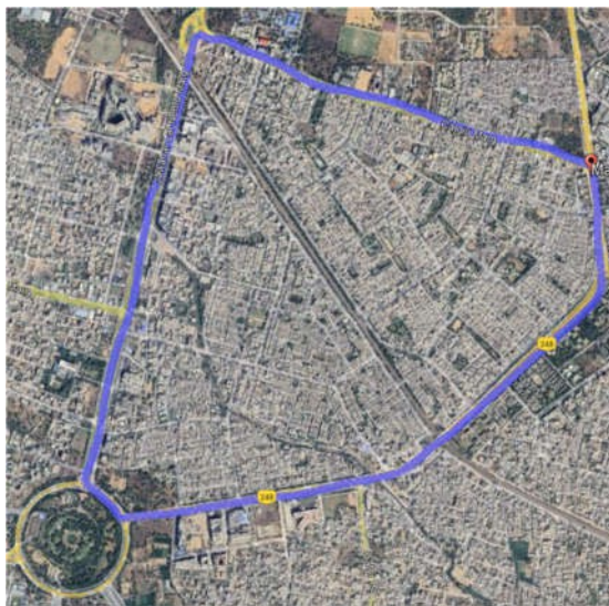
Figure 1: Google Imagery for Malviya Nagar,

Jaipur is amongst few of the first planned cities of Modern India. The southern region of the city has neighbourhood named Malviya Nagar after the freedom fighter Madan Mohan Malviya. Currently, it's one of the poshest and most upmarket locations in Jaipur city. Its house to numerous government housing scheme while also caters to large number of private developers too. It has amenities as schools, universities, hospitals, Techno hub, restaurants, malls, showrooms and many other attractions. The neighbourhood is well connected with all the prime locations of the city, while the airport also being just 5-10 minutes away. The total area for Malviya Nagar is 3.284 sqkm (Source: Jaipur Development Authority) housing a population of 29033 persons (Source: Census Report 2011)