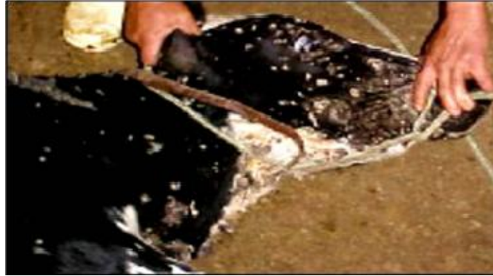
Figure 1. Bovine bearer of cutaneous papillomatosis with exophytic tumors located preferentially in the anatomic region of the head, neck, around the eyes and snout before autogenous vaccine treatment.