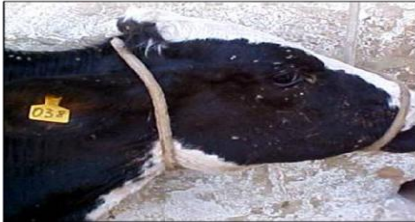
Figure 3. Contention of the same male bovine for vaccine treatment, surgical extraction of verrucous lesions for histopathology analysis to compare the regression with the clinical observation.