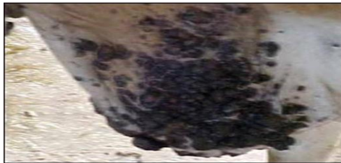
Figure 2. Macroscopic view of male bovine tumors with different morphologies before the initial treatment, presenting cauliflower aspect with dark color and another intermediate neoformations.