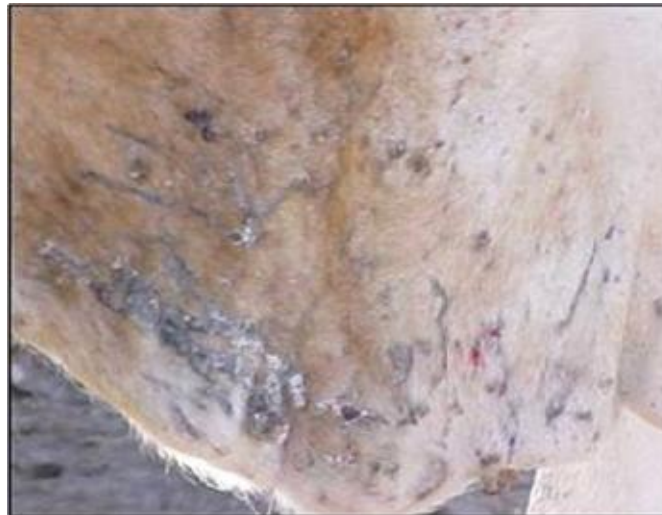
Figure 4. Clinical evaluation of the same female bovine after have being submitted to two doses of vaccine with fall and regression of the warts lesions and formation of scars in the epithelium scaly.

size from 5 to 10 mm at the largest axis were present. The animals submitted to the vaccination treatment were clinically accompanied for observation of lesion regression at a histological level (figure 3). Histologically, the tumors were characterized by fibroblastic proliferation with overlying acanthosis, orthokeratotic hyperkeratosis and parakeratosis cells. The tumor cells exhibited an infiltrative growth at the interface with normal tissue, expanding the dermis and surrounding moderate epithelial hyperplasia, as well as vacuous cytoplasm in the granular stratum, with presence of large and irregular